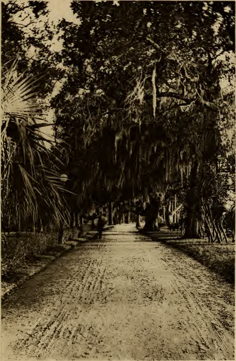
ENCLOSURE OF CLUB GROUNDS